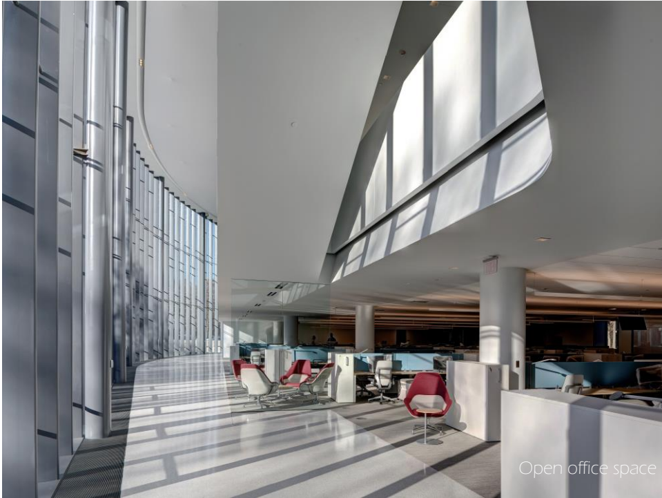
Open office space